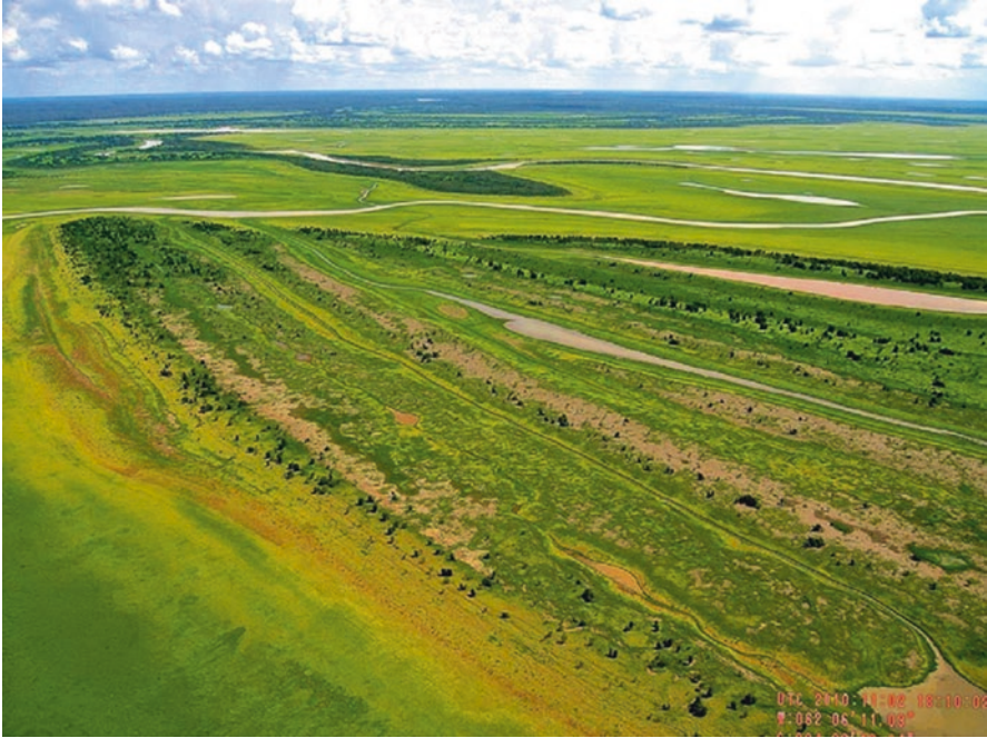
Fig. 19.2 Amazon basin in a severe drought showing the fragmentation of the water courses inhabited by manatees. Such fragmentation can result in an increase in hunting

to hunting (Miriam Marmontel and Eduardo Moraes Arraut, pers. obs.) as discussed below (Fig. 19.2). Under prolonged drought conditions, aquatic plants do not survive, and manatees resort to ingesting organic matter from the bottom, and consuming sediment in large quantities, a practice which may cause death by obstruction of the intestine (Miriam Marmontel pers. obs.). One of the scenarios for the hydrological cycle in the Amazon basin associated with climate change (Sorribas et al. 2016) predicts that extreme droughts will become more frequent and recurrent in the region. If this scenario prevails, not only will there be more frequent years in which manatee forage is extremely scarce, but manatees will also suffer from more frequent and prolonged periods of vulnerability to predation, especially hunting as discussed below.