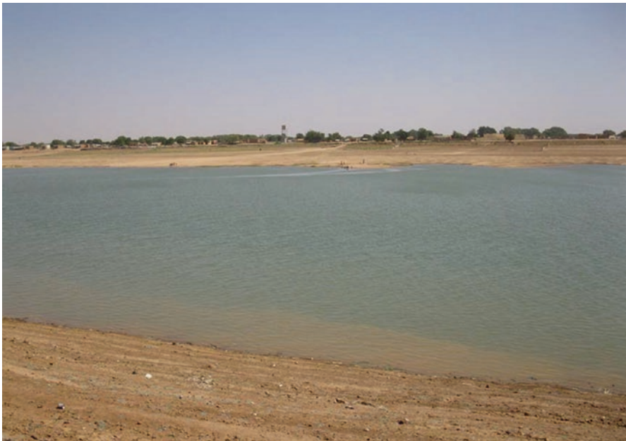
Fig. 19.3 The Senegal River is the boundary between Senegal, Mauritania and Mali, and its flow is now controlled by the Manantali Dam. This view of the river in the dry season shows the greatly reduced habitat for manatees that could become more severe with increasing desertification

The African manatee occupies the widest range of habitats of any sirenian. The waterways used by manatees range from lagoons within equatorial rainforests in Central Africa to rivers at the edge of the Sahara Desert, to coastal mangrove channels and islands in the Atlantic Ocean. Throughout their range, African manatees migrate seasonally, based upon changes in water levels, moving up flooded rivers during annual rainy seasons to exploit food resources that are unavailable during dry seasons (Powell 1996; Keith Diagne 2015). Climate change in West and Central Africa is predicted to make dry areas drier and wet areas wetter, with longer and more frequent dry periods (Christensen et al. 2013). Therefore, manatee habitat in Central Africa may increase, but habitat loss due to drying and desertification will likely occur in the northern part of the species' range. Manatee populations in Mali, Niger, Senegal, Mauritania, Chad and Northern Nigeria are likely to be the most affected by desertification (Figs. 19.3).