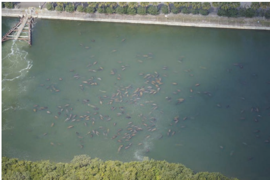
Fig. 19.5 Manatees overwintering at an industrial warm-water refuge in Florida

stress on already compromised systems, and future water withdrawals are expected to increase by 21% by 2030 (Florida Department of Environmental Protection 2014). Loss of these refuge sites or reduction in their carrying capacity has been identified as a significant threat to the long-term viability of the population (Runge et al. 2007).