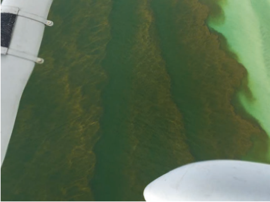
Fig. 19.4 Algal blooms are capable of smothering underlying sea grasses and persisting for days to weeks under the right climatic conditions

less, algae blooms can critically alter ecosystems, disrupt food webs, stimulate the growth of pathogens and have other ecological consequences (Wells et al. 2015; Fig. 19.4). Increasingly there is concern that climate change will result in changes in the phytoplankton community, which will increase the prevalence and geographical spread of algae blooms (Wells et al. 2015). Some harmful species are likely to become more successful under future climate conditions, whilst other species may diminish (Hallegraeff 2010).