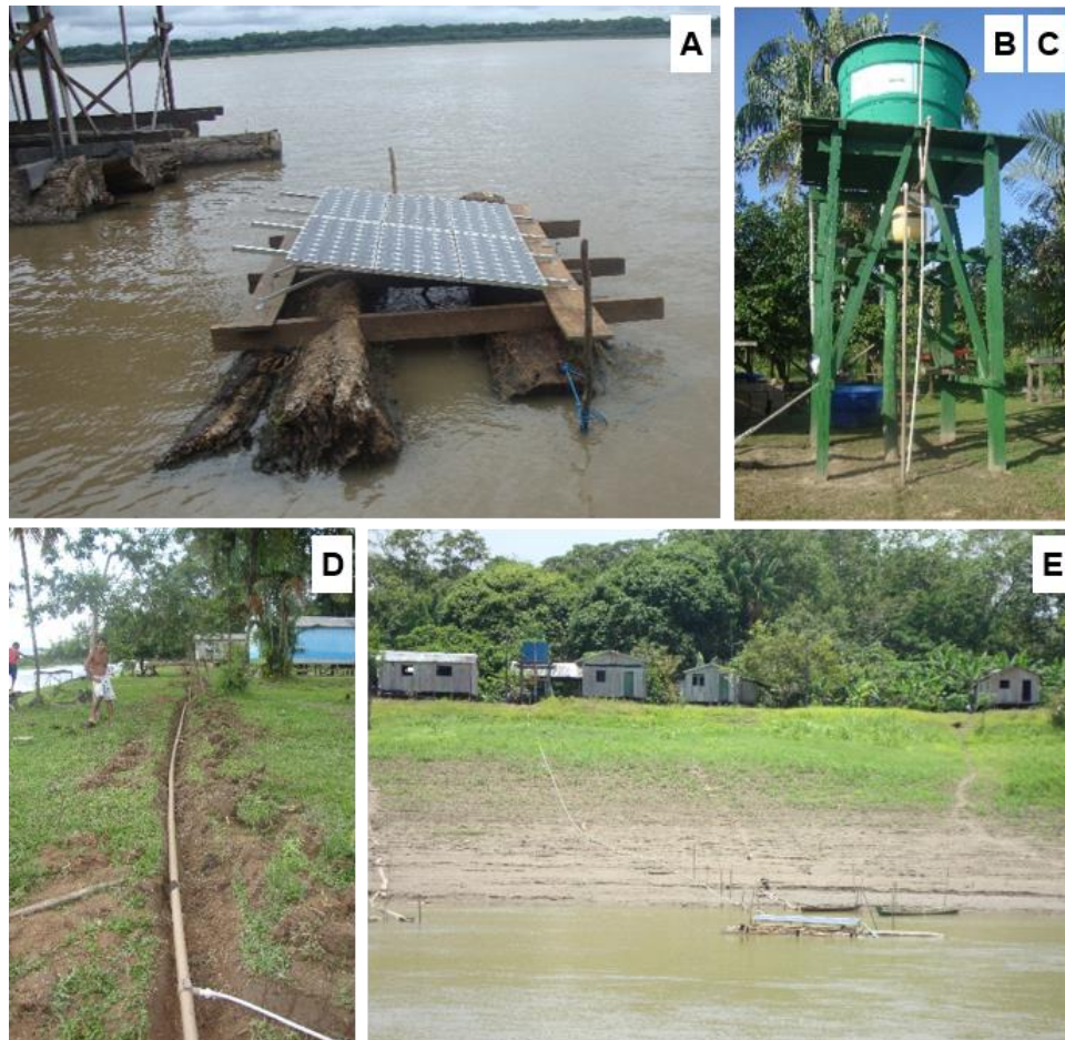
Figure 1. Water supply system operating in RDS Mamiraua

are provided by the community (as a collaborative contribution). Equipment needed to generate solar photovoltaic energy was generally purchased from retailers located in the Centre-West or Southern regions of Brazil.