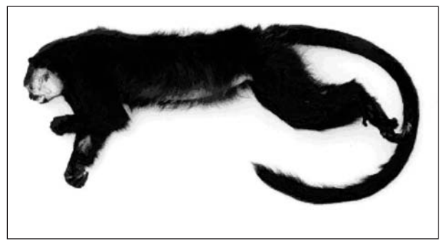
Figure 2. Adult male of Saguinus inustus killed by local inhabitants of the Amanã State Sustainable Development Reserve, Amazonas.