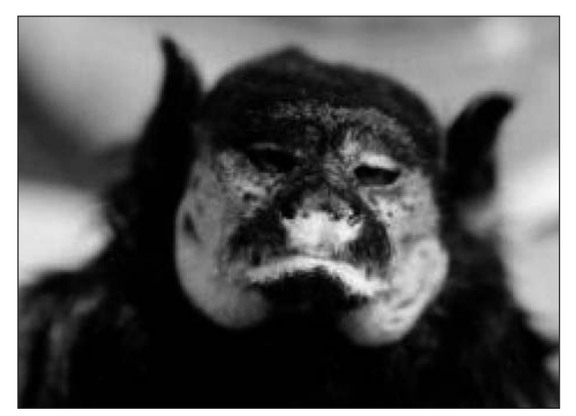
Figure 3. The mottled face of Saguinus inustus.