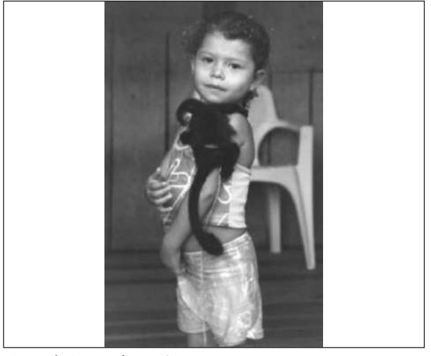
Figure 4. A juvenile pet S. inustus.

that may occur in the area but have not been recorded there to date are members of the genera Pithecia , Ateles and Lagothrix .