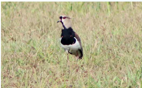
Figure 1: Vanellus chilensis , recorded at kilometer 3 of the Emade road, municipality of Tefé, Amazonas State, upper-mid Amazon River region in Brazil on July 27, 2015 (Credits: David Pedroza Guimarães).

On July 27, 2015, during an ornithological inventory in the rural area of the municipality of Tefé, Amazonas state, we spotted a group of five individuals at kilometer 3 along the Emade road (3°25'54.84"S,