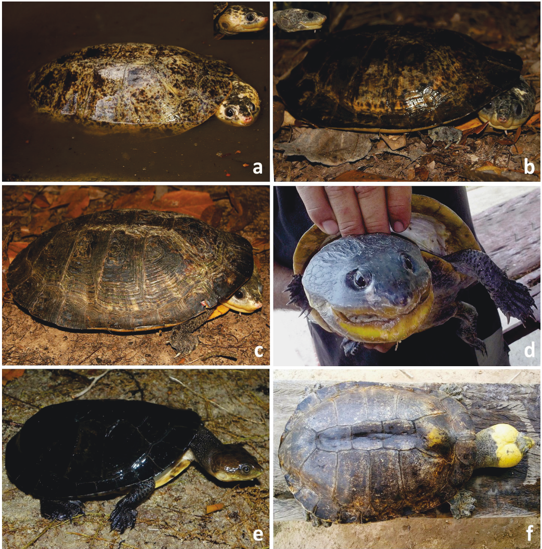
Figure 2. Some of the Mesoclemmys raniceps individuals recorded during this study: a) General picture and detail of the head of one of two specimens captured at Ji-Paraná, Rondônia; b) Adult female captured at Itupiranga, Pará; c) One of the two specimens captured at Itaituba/Trairão, Pará; d) Specimen captured at Monte Alegre, Pará; e) Female captured at Faro/Oriximiná, Pará; f) Male captured at Alto Alegre do Parecis, Rondônia.

but relatively transparent, with a maximum depth of 1.5 m. The site was in dense forest that was flooded at the time of specimen capture.