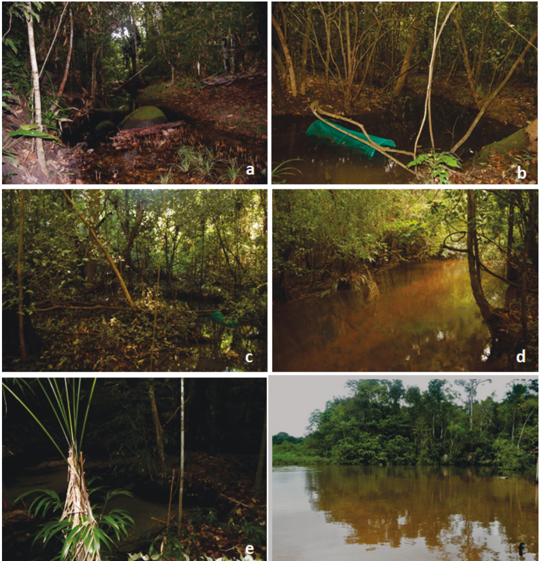
Figure 3. Habitats in which Mesoclemmys raniceps has been captured in Brazil. a) Stream in Jauru, Rondônia; b) Small stream in Itupiranga, Pará; c e d) Streams in Itaituba, Pará; e) Stream in Faro/Oriximiná, Pará; f) Branco river at Alto Alegre do Parecis, Rondônia. Figures b and c show in place the funnel traps that were used to capture M. raniceps at some sites.

of reptiles and amphibians at the Instituto Nacional de Pesquisas da Amazônia , Manaus (INPA-H37242).